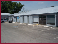
4/2007 The District purchases property for the new HQ

"Act as if what you do makes a difference. It does." William James