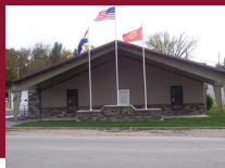
4/2008 Construction is completed and Headquarters moves to its new location

"Act as if what you do makes a difference. It does." William James